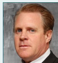
Nigel Willmott Taylor Wealth Management